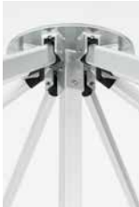
Telescoping crank system