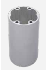
Extruded aluminium mast (strengthened)

Frames are made of Marine Grade Anodised Aluminium with a 3 year warranty against mechanical defects.