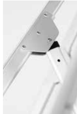
Double reinforced joints