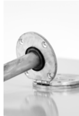
Hinged spigot installation